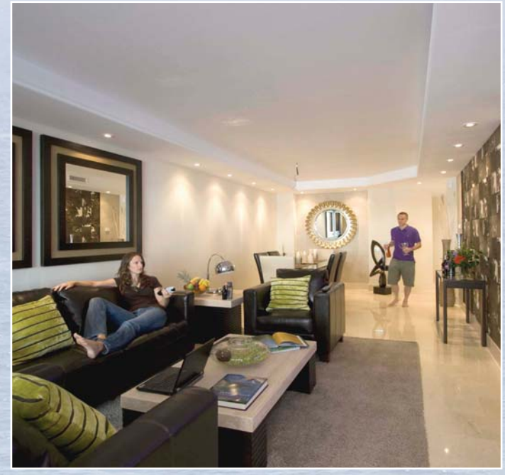
Custom-made furniture, mirrors and light fittings....Rugs on the Marble Floors.....Classic Italian Leather 2 or 3-seater Sofa & 2 Leather Armchairs; Marble Coffee Table, Table Lights; 8-seater Classic Glass Top Dining Table with 6 High Back Leather Dining Chairs; Sony HD TV, Sky TV, Vita Audio with iPod Link Sound System and Sony Playstation 3.

The welcoming marble reception area leads directly into the well lit and bright, open plan 29.82m2 Lounge / Dining Area with feature walls and striking mirrors. The "home from home" feeling provides a perfect ambience for all year round living, whether it is spilling out onto the Terrace in the height of summer, or curled up in front of the wall mounted TV, or the working chimney.