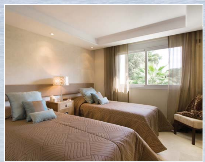
Mirrors, lights, bedside tables, and the same ultra comfortable beds, with storage. Vita Audio r4 CD/DAB/FM + iPod Link & remote control

For guests or other family members, the 13.37m2 beautifully decorated second bedroom is at the rear of the apartment, with fitted wardrobes and full length mirror. The beds can be configured as 2 Twin Beds or a Double with the mattresses zipped together.