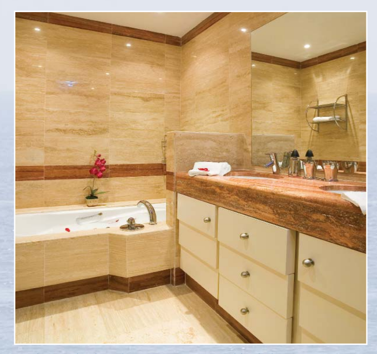
On the way back to the Reception is a marble clad Guest WC