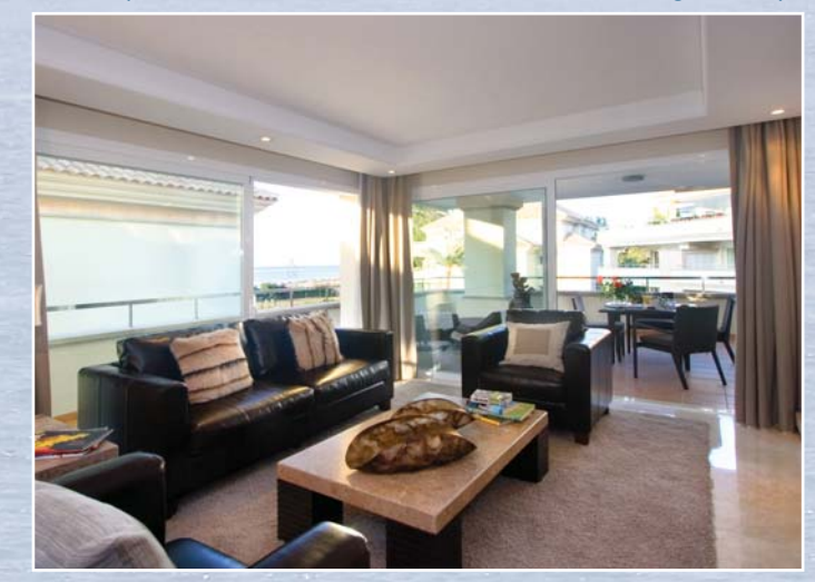
Custom-made furniture, mirrors and light fittings....Rugs on the Marble Floors.....Classic Italian Leather 2 or 3-seater Sofa & 2 Leather Armchairs; Marble Coffee Table, Table Lights; 8-seater Classic Glass Top Dining Table with 6 High Back Leather Dining Chairs Sony HD TV, Sky TV, Vita Audio with iPod Link Sound System and Sony Playstation 3.

Enter into a Reception area of 10.29m2 leading to the Lounge, Bedrooms and the Kitchen. The welcoming marble reception area leads directly into the well lit and bright, open plan 31.89m2 Lounge / Dining Area. Because the unit is on a corner, it has the significant advantage of having windows across the entire length of the apartment as well as the doors to the Terrace. The "home from home" feeling provides a perfect ambience for all year round living, whether it is spilling out onto the Terrace in the height of summer, or curled up in front of the wall mounted TV, or the working chimney.